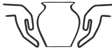
Regional Craftsmanship & Cultural Heritage