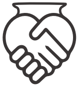
Collaborative & Cooperative Production

Our mission is to inspire a more conscious, inclusive, and collaborative approach to technology—a vision where sustainability and heritage shape the future.